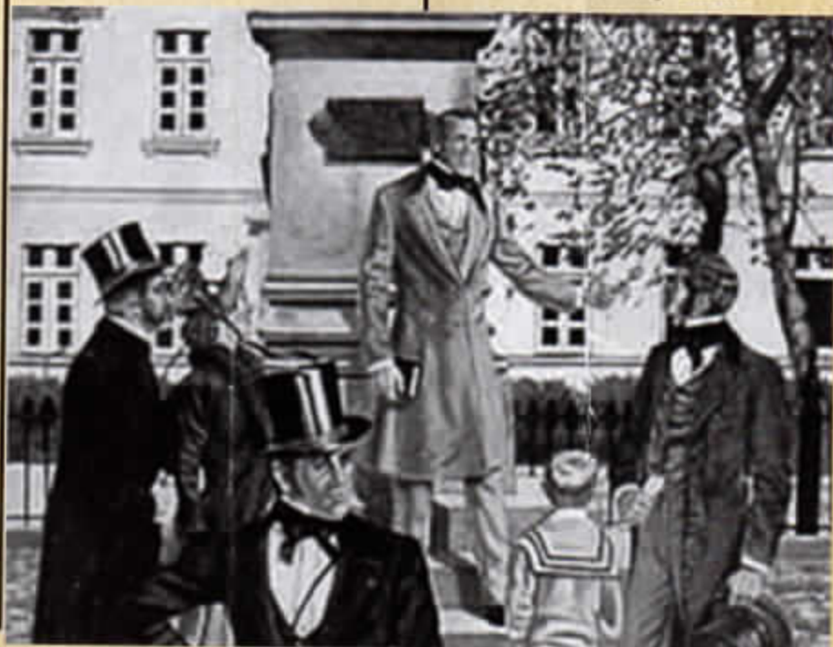
Elder John Taylor preaching the Gospel in England

He preached in Liverpool and was responsible for moving the work forward in Ireland and the Isle of Man. After the death of Brigham Young, John Taylor was called to be President of The Church of Jesus Christ of Latter-day Saints.